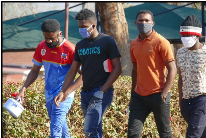
Carrying Lunch Boxes to the University Dining Hall.

Attending a fund raiser recently for a new fence for a pastor's house, I was reminded of school 'lunchbox' days. The lunchboxes my children took to school were often unimaginative compared to the delicious, exotic, spicy lunches of other students! Worse still, they were sometimes – well, embarrassing – carrot sticks and left-overs!